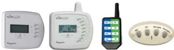
Indoor Control Panel (for 4 or 8 function control)